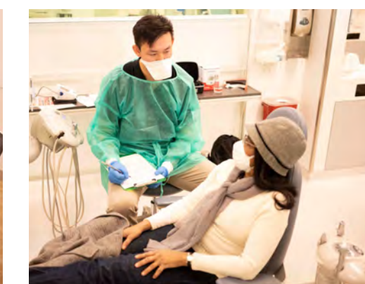
Dental Student administering dental screening exam