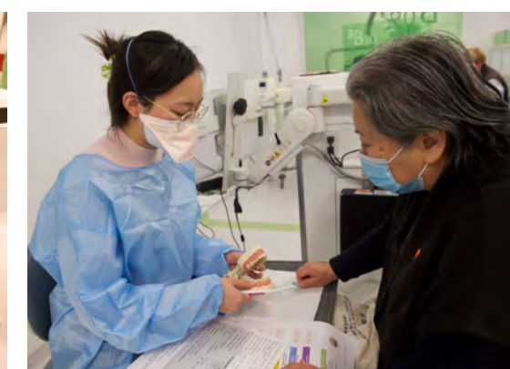
Counseling attendee on proper oral hygiene practices