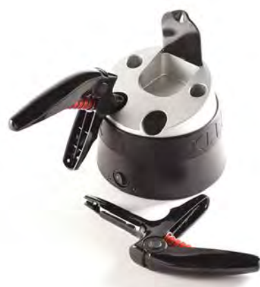
Bioclear HeatSync Composite Warmer

Bulk-fill resin composites are currently the material of choice in direct restorations. They claim to possess lower post-gel shrinkage and higher reactivity to light polymerization than most conventional composites as a result of their increased translucent, improving the light penetration and the depth of cure. 5,6