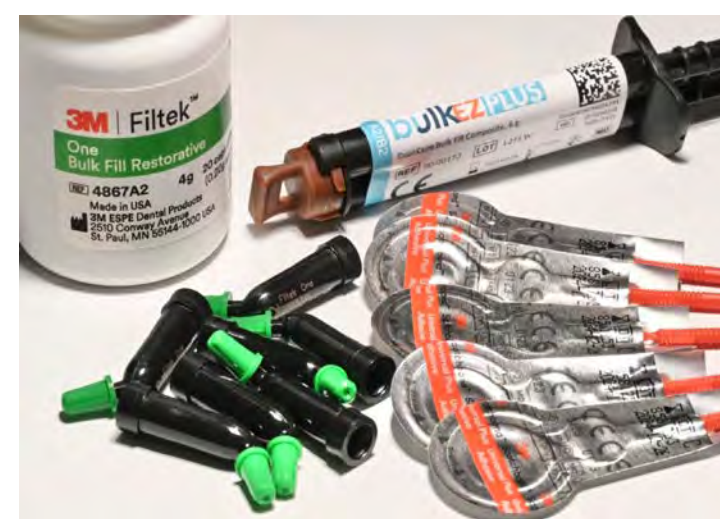
Filtek Bulk One 3M (lower left), BulKEZ Plus Zest Dental (upper right), Scotchbond Universal Plus 3M (lower right)