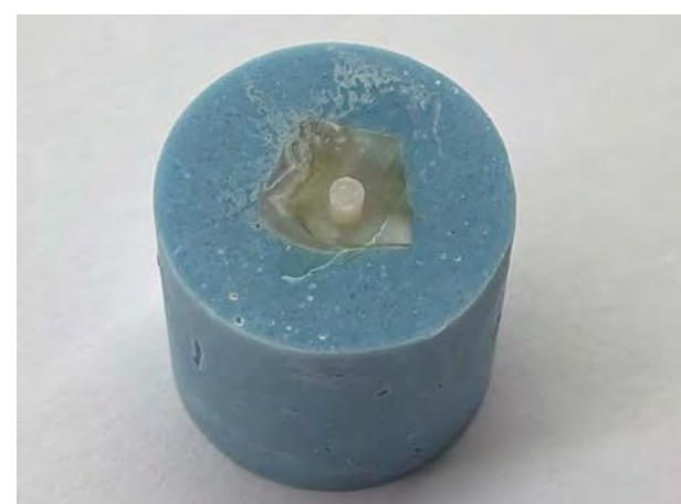
Prepared Resin Sample with Composite Bonded to Dentin