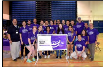
Figure 1. Special Olympics Special Smiles dental screening event with dental resident and student volunteers.

The Special Smiles discipline of Healthy Athletes provides attainable information, resources, and comprehensive oral health care to participating Special Olympics athletes.