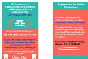
Image 4: SCOPE Chinatown Health Fair Animated Flyer (distributed via hard copy and social media)