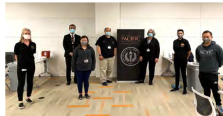
Image 5: SCOPE officers volunteering at the UOP COVID-19 vaccine clinic for individuals with intellectual and developmental disabilities held March 27th, 2021