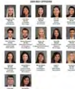
Image 2: SCOPE Officer Roster 2020-2021